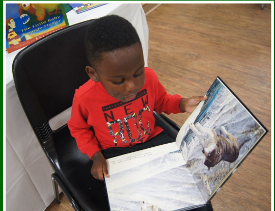
A child enjoys a book during the Little Free Library dedication.