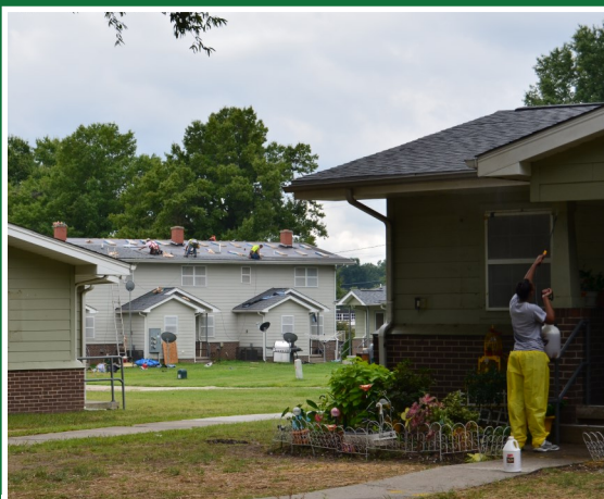
RAD renovations have begun at Hampton Homes including roof replacements and exterior painting of all apartments.

RAD will allow GHA to convert its Public Housing units to Project-Based Section 8 vouchers. Through RAD, GHA will be able to take full ownership of its public housing units and renovate the housing using private sources of financing. This will allow GHA to do much needed repairs and improvements to our communities that have not been possible with HUD funding alone.