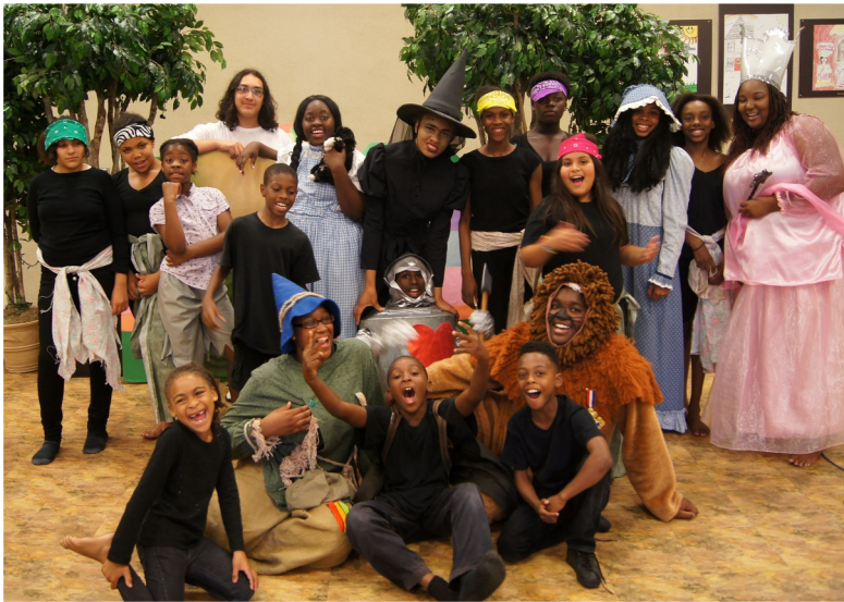
The cast of "The Wiz", the latest production for the "It's Your Time to Shine" theater arts program

Greensboro Housing Authority was honored as an Award of Excellence winner by the National Association of Housing and Redevelopment Officials (NAHRO) at NAHRO's national conference in Los Angeles, CA. Each year NAHRO recognizes outstanding innovation and achievement in housing and community development programs throughout the country through the awards program which includes a Regional Award of Merit and the National Award of Excellence. GHA received the award in Program Innovation for its "It's Your Time to Shine" theater arts program.