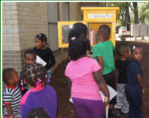
Children visit the Little Free Library at Smith Homes.

Perhaps you have seen them in your community - small wooden boxes shaped like little houses and filled with books. These are Little Free Libraries that have been placed in the Smith Homes, Riverbirch, Hampton Homes and Hickory Trails communities for the benefit of all Greensboro Housing Authority (GHA) residents.